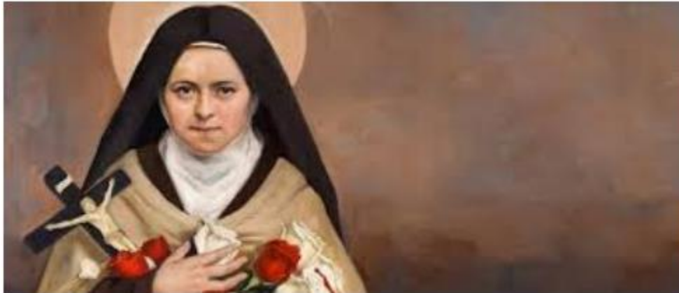
Memorial of Saint Theresine of the Child Jesus

We will be celebrating the Feast Day of our Patron Saint, St. Theresine of Lisieux at our School Mass on Wednesday.