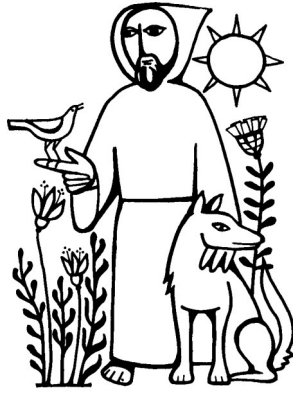
St. Francis, pray for us

Let us together pray to our God through the intercession of St. George and St. Francis. As one voice of the parish let us ask God & His Son to look kindly on our nation that we come together to rebuild the trust and peace, that the virus be soon over, that our young in front line of many conflicted places be safe and protected. Amen.