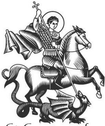
St. George, pray for us.

Let us together pray to our God through the intercession of St. George and St. Francis. As one voice of the parish let us ask God & His Son to look kindly on our nation that we come together to rebuild the trust and peace, that the virus be soon over, that our young in front line of many conflicted places be safe and protected. Amen.