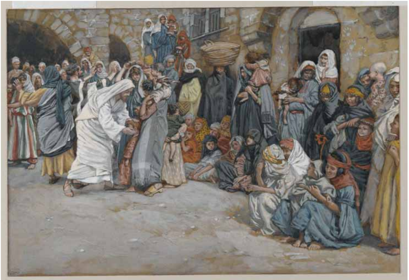
Suffer the Little Children to Come unto Me

Then they came to Capernaum; and when he was in the house he asked them, "What were you arguing about on the way?" But they were silent, for on the way they had argued with one another who was the greatest. He sat down, called the twelve, and said to them, "Whoever wants to be first must be last of all and servant of all." Then he took a little child and put it among them; and taking it in his arms, he said to them, "Whoever welcomes one such child in my name welcomes me, and whoever welcomes me welcomes not me but the one who sent me." (Mark 9.33-37, NRSVCE)