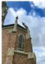
At each end of the vestibule, a 4' sandstone finial was damaged. The one on the western end is leaning toward the roof. The one on the eastern end fell to the ground.