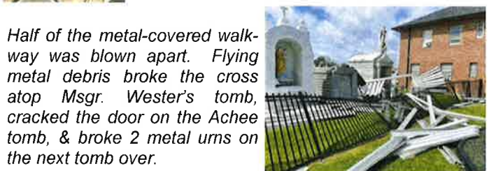
Half of the metal-covered walkway was blown apart. Flying metal debris broke the cross atop Msgr. Wester's tomb, cracked the door on the Achee tomb, & broke 2 metal urns on the next tomb over.