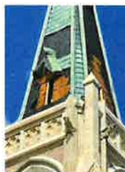
The steeple lost copper roofing on all 4 sides. The gable & louvers were blown off of the south side. Part of the gable remains on the western side while part of the louvers remains on the eastern side but the other parts of each were blown away.

Here are some pictures sent by Fr. Baker, showing hurricane damages to the Cathedral of St. Francis de Sales.