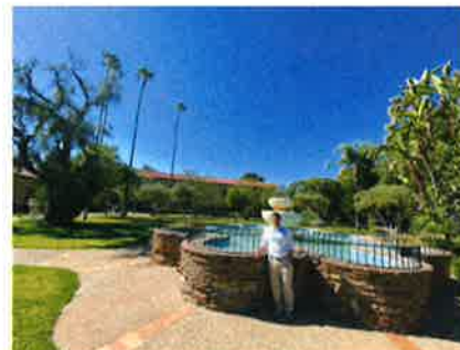
Mission San Fernando Rey de Espana Founded on September 8, 1797