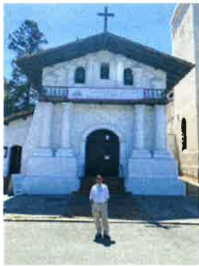
Mission San Francisco de Asis (a.k.a. Mission Dolores) Founded by St. Junipero Serra on June 29, 1776

Saint Junipero Serra was a Franciscan missionary who made California history in 1769 when he founded Mission San Diego de Alcalá . He founded the first 9 of 21 missions established by Spanish padres in California to convert Native Americans to Catholic Christianity. The missions stretch from San Diego to Sonoma. I was privileged to visit 7 of the 21 missions during my recent visit to California.