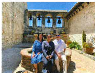
Bells of San Juan Capistrano

My classmates from Physical Therapy school came to meet me at the mission.