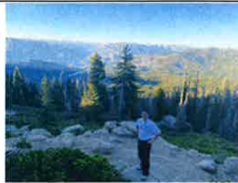
Kings Canyon & Sequoia National Parks CALIFORNIA

Driving through Tunnel Log was a lot of fun!