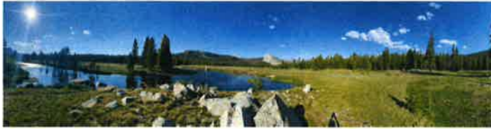
Yosemite National Park CALIFORNIA