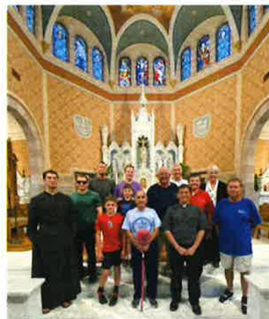
A big thank you to all who attended our last Cathedral Clean-Up Day!