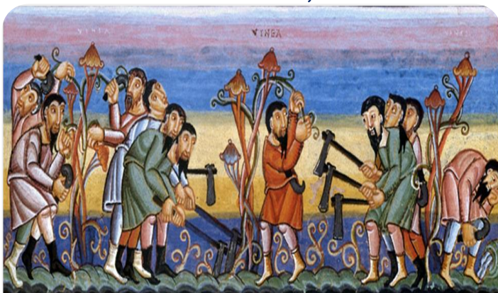
Parable of the Workers in the Vineyard [Codex aureus Epternacensis]