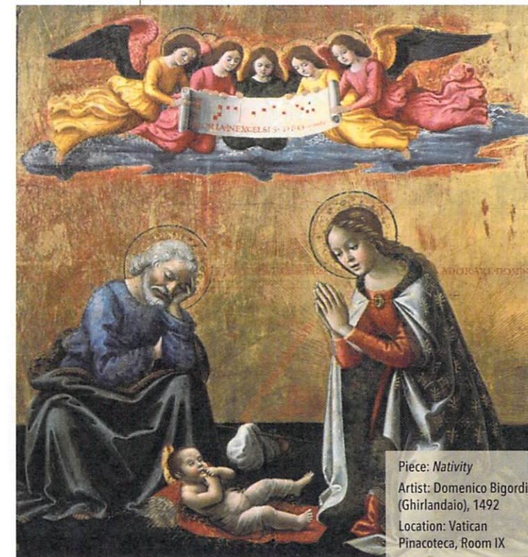
Piece: Nativity Artist: Domenico Bigordi (Ghirlandaio), 1492 Location: Vatican Pinacoteca, Room IX