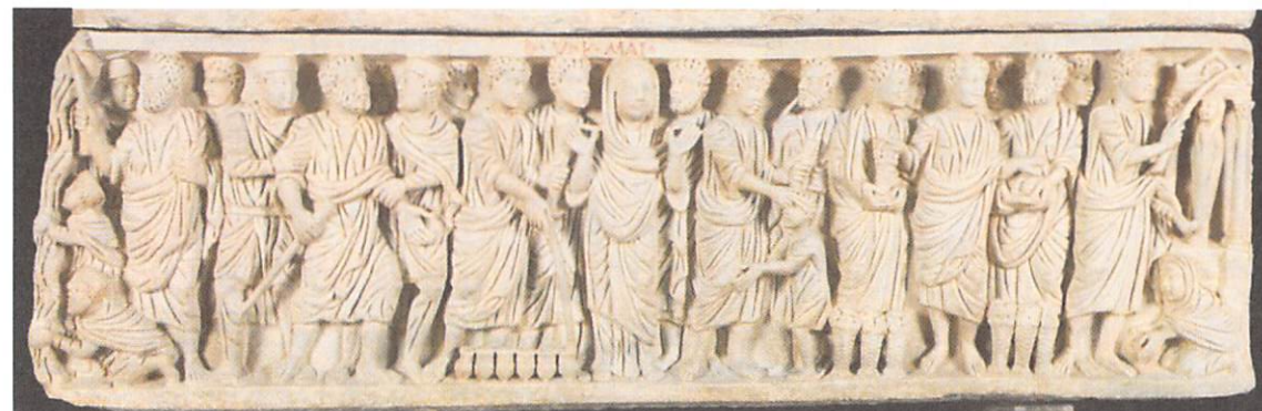
Piece: Sarcophagus, Pius-Christian collection, Third century Artist: Unknown Location: Vatican Museums

Am I generous with my time, treasure, and talent? Do I multiply what I have by giving it to God and others, allowing him to return it to me twelvefold?