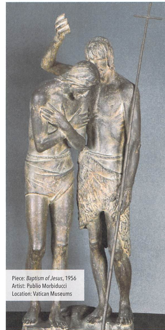
Piece: Baptism of Jesus , 1956 Artist: Publio Morbiducci Location: Vatican Museums

Am I courageous enough to ask the Holy Spirit to come down and touch my soul with his fire?