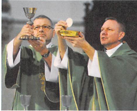
DEACON, AT LEFT

Transitional and permanent deacons can baptize, give homilies at Mass, give blessings (for example, the blessing of throats on St. Blaise's feast day), perform the Benediction of the Blessed Sacrament, and preside at wedding and funeral services where there is no Mass.