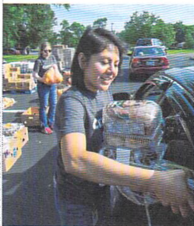
In the poor, Jesus is with us. Here, volunteers work at a food pantry in Nashville.

B efore the resurrection, Jesus likely would have suffered the ravages of illness and lack of proper nutrition that all the people of his time were subject to. After the resurrection, Jesus showed he was exalted with the very power of God. Even his physical appearance had changed.