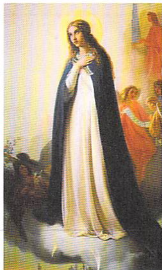
THE ASSUMPTION OF THE VIRGIN MARY, PAVIA CATHEDRAL

From Catholic and Cornered: Answers to Common Questions About Your Faith , © 2011 Liguori Publications