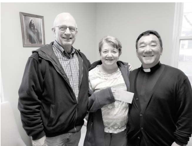
2 nd Place