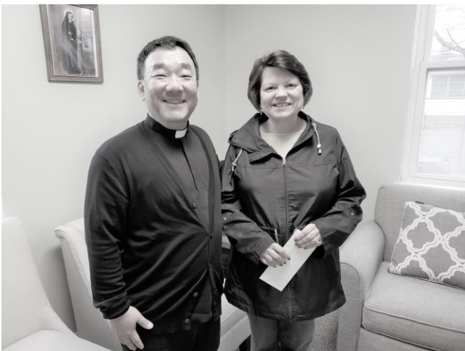
3 rd Place