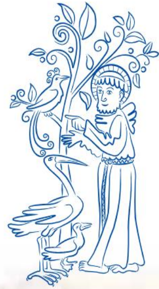
Saint Francis of Assisi

Some people show a strong love for God. Francis of Assisi did this. He was a true friend of God. He is a saint .