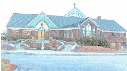
Artist's rendering of the church by Jeannine Migliorino