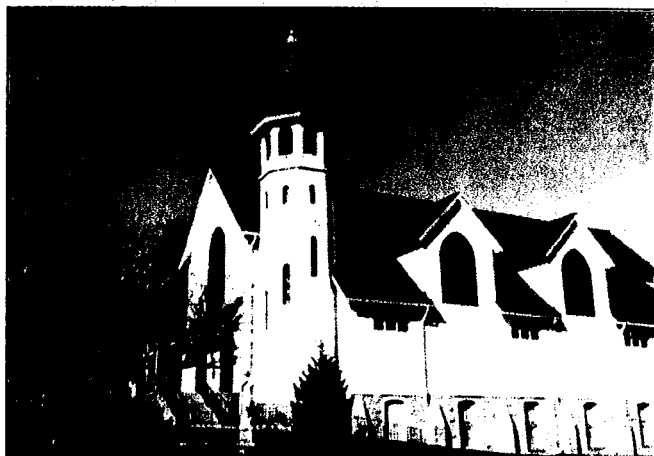
Immaculate Conception Church

4 Lavelle Road, P.O. Box 109 Amenia, New York 12501