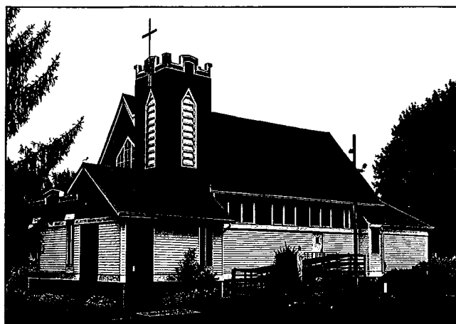
Saint Anthony's Church

4 Lavelle Road, P.O. Box 109 Amenia, New York 12501