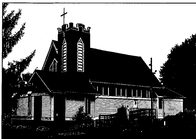
Saint Anthony's Church

4 Lavelle Road, P.O. Box 109 Amenia, New York 12501