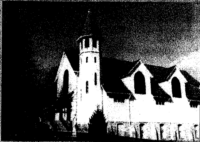
Immaculate Conception Church

4 Lavelle Road, P.O. Box 109 Amenia, New York 12501