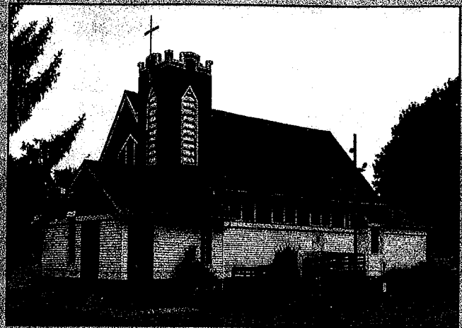
Saint Anthony's Church

4 Lavelle Road, P.O. Box 109 Amenia, New York 12501