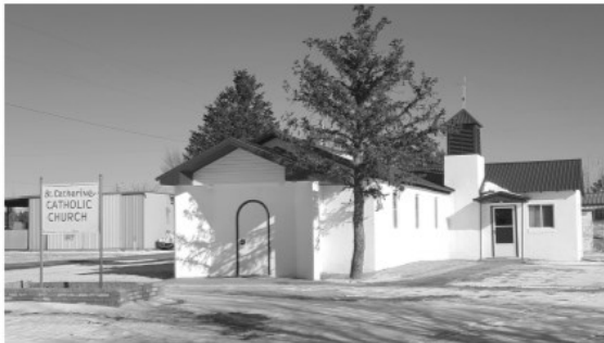
Come and experience the beautiful, ancient Mass of the Church!

The address is 319 Brownhorn, Melrose, NM 88124. It's right off of highway 60, turn north onto the Tucumcari Truck Route, i.e. NM 268 which is the street furthest west in Melrose, and it's right there on the east side, our beautiful little white church with a blue roof.