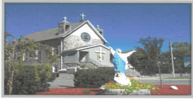
211 Homestead Avenue, Maybrook, NY 12543