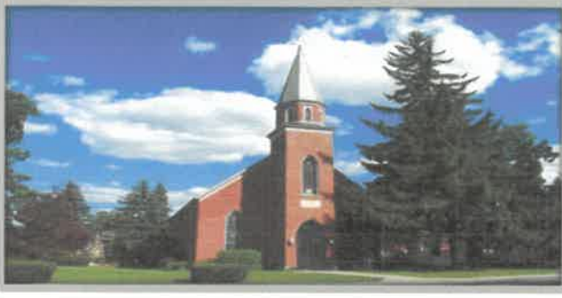
89 Union Street, Montgomery, NY 12549