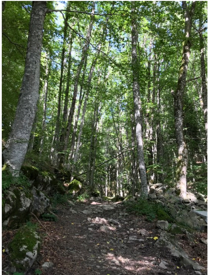
Woods at Alverna, Italy