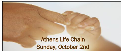
Athens Life Chain Sunday, October 2nd 2:00 - 3:00 p.m. UGA Arch