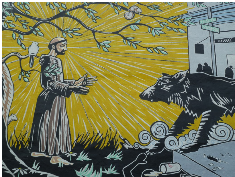
This beautiful mural is found on the St. Francis Inn in Philadelphia

"I have done what was mine to do, may Christ now teach you what you are to do." St. Francis of Assisi