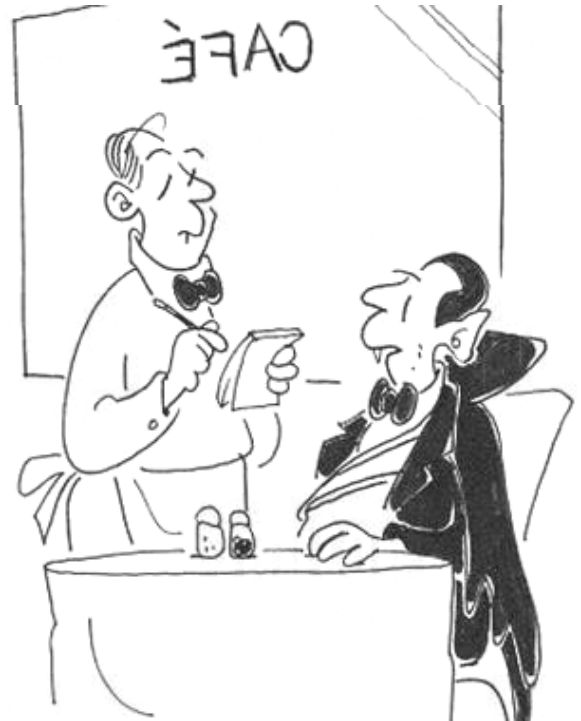
"Spaghetti dinner. Hold the garlic bread."

Churck Berry's beguiling song from 1959 about aging out of the insecurities and drama of the teenage years didn't "grow" so high on the charts, just making it into the Top 40. But, through your generosity, we've "almost grown" enough to cover our winter fuel needs. Thank you.