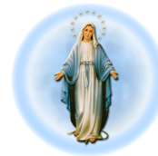
Legion of Mary