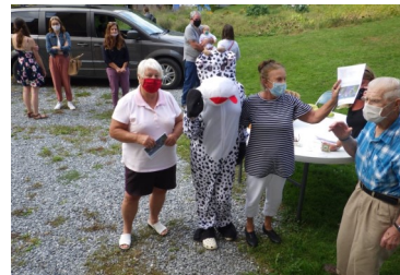
Carla the Cow was "herded" over to our 4pm Mass to ruminate about Cow Plop Bingo.

We will be holding a Virtual Cow Plop on Sunday, October 11th. The event will be aired on Facebook Live and you can follow all the details on our Facebook Event page. Deeds are $20 each for the chance to win $1,000 if the cow "plops" in your square. Deeds can be purchased at the Rectory and will also be available at all Masses. Completed deeds with payment can be dropped in the collection basket at Mass or turned into the Rectory. More details to follow!