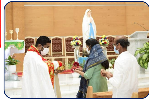
The Nativity of the Blessed Virgin Mary Celebration Malayalam Community (10-Sep)