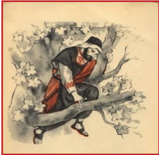
Up a Tree

Reading I: Wisdom 11:22-12:2 Responsorial Psalm: 145:1-2, 8-9, 10-11, 13, 14 Reading II: 2 Thessalonians 1:11-2:2 Gospel: Luke 19:1-10