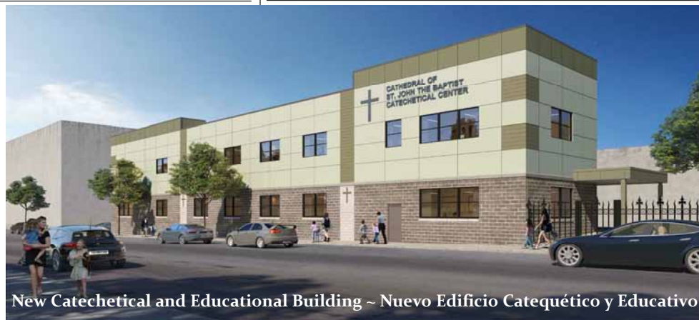
New Catechetical and Educational Building ~ Nuevo Edificio Catequético y Educativo

Every Monday after the 7:00 PM Spanish Mass