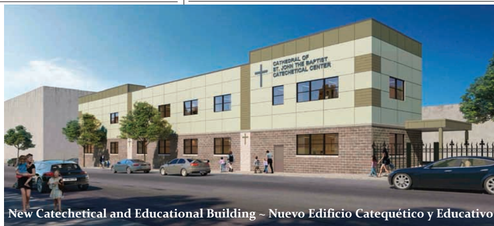
New Catechetical and Educational Building ~ Nuevo Edificio Catequético y Educativo

Every Friday after the 12:30 PM Mass until the 7:00 PM Mass.