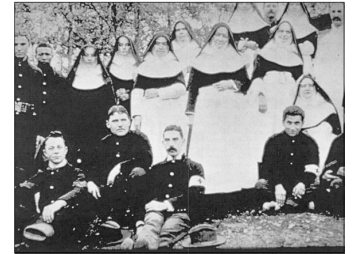
Civil War Nun/Nurses.

Last week's Treasure mentioned the "Nuns of the Battlefield," religious sisters from several communities who served as nurses in the Civil War. Florence Nightingale had only instituted female nurses a decade before in the Crimean War, so the idea of women tending to wounded soldiers was extraordinary. The medical and sanitary conditions on the battlefields were appalling, and the sisters were nearly all teachers. Few had any medical training beyond what they had learned as youngsters in the family. Anti-Catholic prejudice was so deeply entrenched in America that sisters could not wear their habits in public. These sisters were the first, and people on both the Union and Confederate sides soon began to marvel at their bravery, efficiency, and respect for Protestant soldiers. More than six hundred sisters from twenty-one communities went to war, serving in wretched conditions. They were tough and single-minded, efficient and fearless.