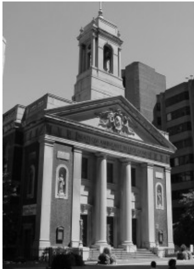
Church of Saint Andrew 20 Cardinal Hayes Place NY, NY 10007

THE THIRTY-THIRD SUNDAY IN ORDINARY TIME