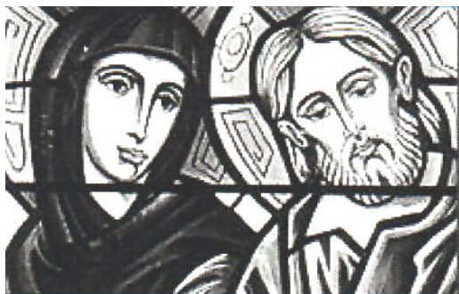
Ss. Joachim and Anne Feast Day: Monday, July 26