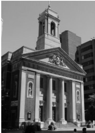
Church of Saint Andrew 20 Cardinal Hayes Place NY, NY 10007