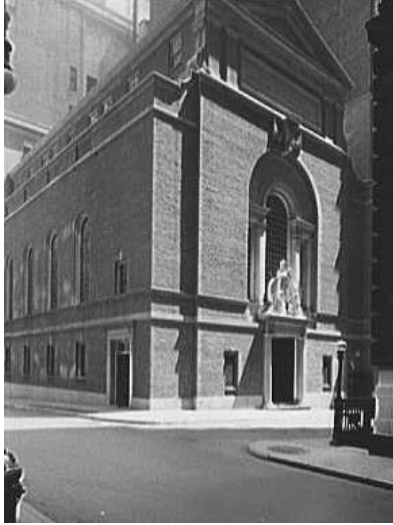
Church of Our Lady of Victory 60 William Street NY, NY 10005