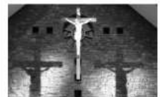
This is what you should see the header is black & white

St Thomas has a new Facebook page it is: Saint Thomas Church Indianola IA