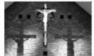
This is what you should see the header is black & white

St Thomas has a new Facebook page it is: Saint Thomas Church Indianola IA