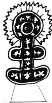
symbolic pastry: Monstrance