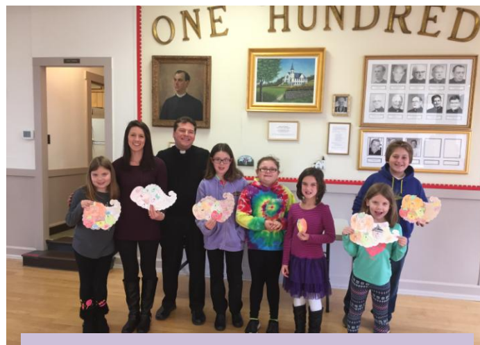
FAMILY MASS THANKSGIVING ACTIVITY

A signup sheet is posted on the Main bulletin board