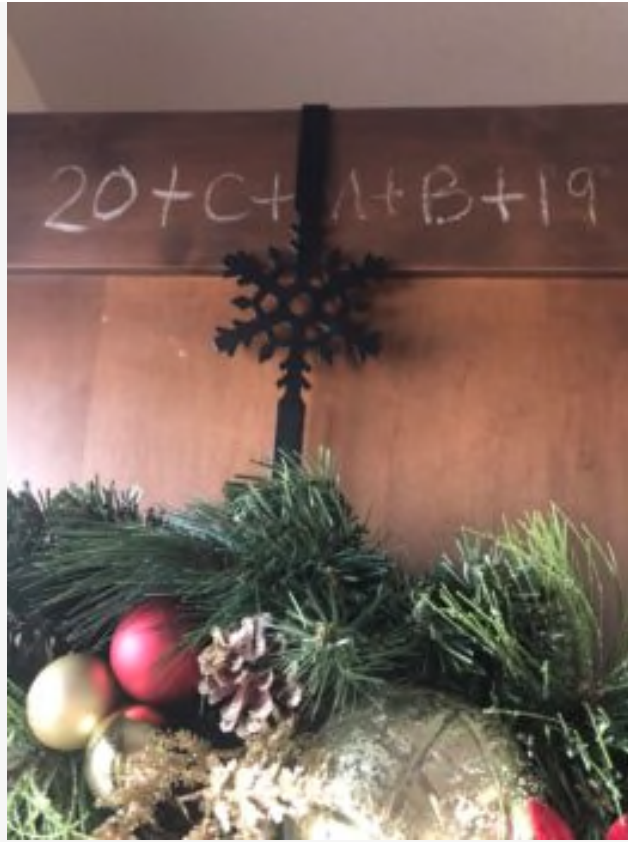
The author's door, featuring an Epiphany blessing for 2019

https://bustedhalo.com/ministry-resources/chalk-it-up-bless-your-door-this-epiphany