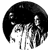
Village Lights June 19 • Cincinnati Fountain Square Event

FOR MORE INFORMATION VISIT www.catholicpilgrimage.com