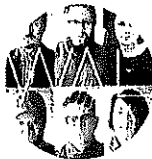
WAL May 29 • Chaminade Julianne Catholic HS • Concert & Mass with the Archbishop