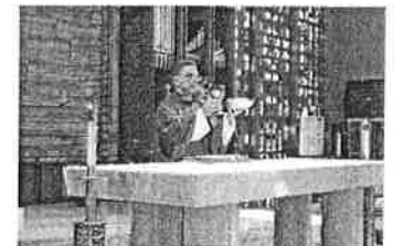
Mass Intention Requests

Please remember your $5.00 donation when you light a votive candle in the church. There is a deposit box for your donation attached to the lower left side of the stand.