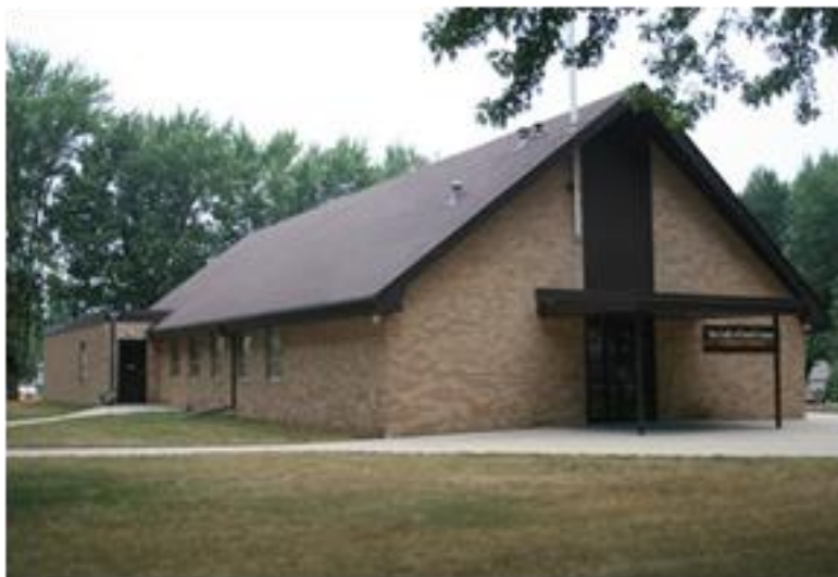
Our Lady of Good Counsel Church 513 Mueller St., Holstein, Iowa 51025 712-368-4755