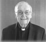
50th Anniversary Priest Priest

Please join us on Monday December 11th at 7:00 pm Guadalupe Bilingual Vigil Mass