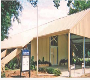
Saint Frances Xavier Cabrini Roman Catholic Mission 901 N. Frederick Kaplan LA 70548