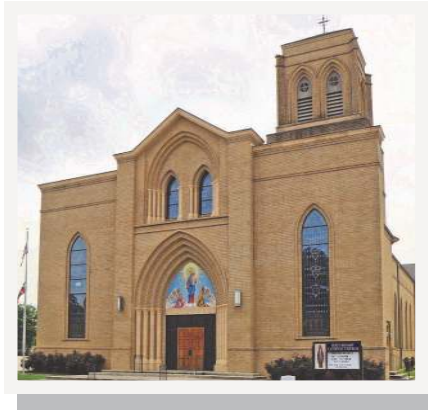
Our Lady of the Most Holy Rosary Roman Catholic Church 602 N. Church Ave Kaplan, LA 70548