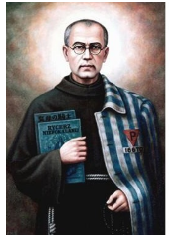
Feast of St. Maximilian Kolbe Feast Day: August 14