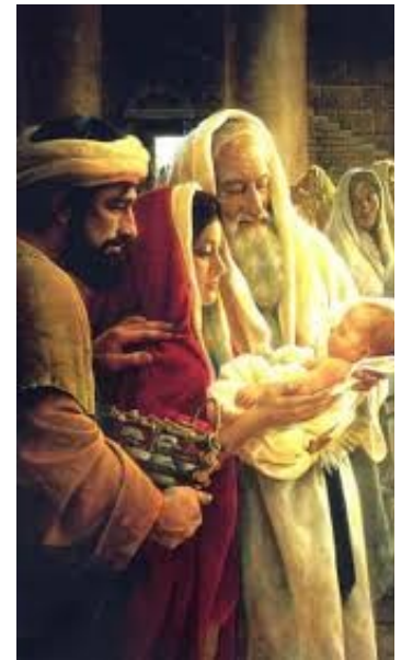
LA PRESENTACIÓN DEL SEÑOR