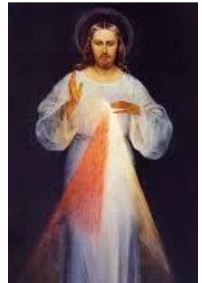
Divine Mercy Sunday April 11

O God, who on this day, through your Only Begotten Son, have conquered death and unlocked for us the path to eternity, grant, we pray, that we who keep the solemnity of the Lord's Resurrection may, through the renewal brought by your Spirit, rise up in the light of life. Through our Lord Jesus Christ, your Son, who lives and reigns with you in the unity of the Holy Spirit, one God, for ever and ever.