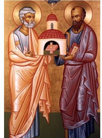
Sts. Peter and Paul Apostles June 29