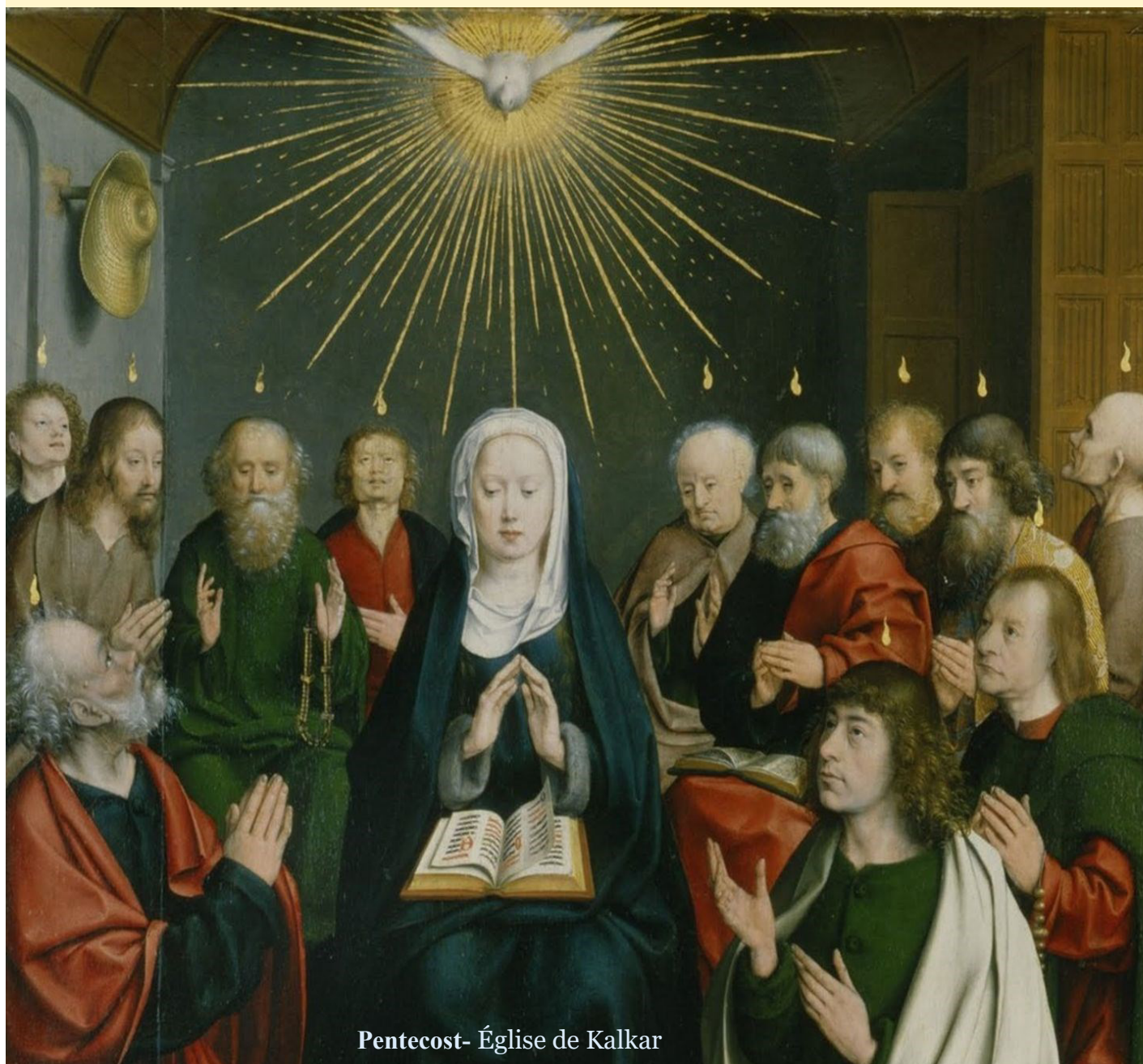
Pentecost- Église de Kalkar

401 S. Willow St. Ellensburg, WA 98926 Office (509) 962-9819